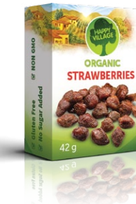
42 gr (1.48 oz) Lunch Box