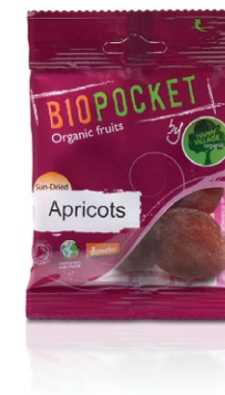
50 gr (1.76 oz) Pillow Bag