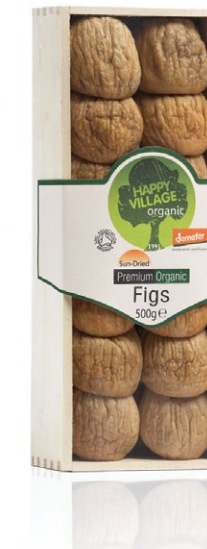
200 gr - 2 kg Specialty / Gift Bag