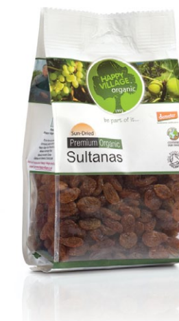
200 gr - 500 gr Quadro Bag