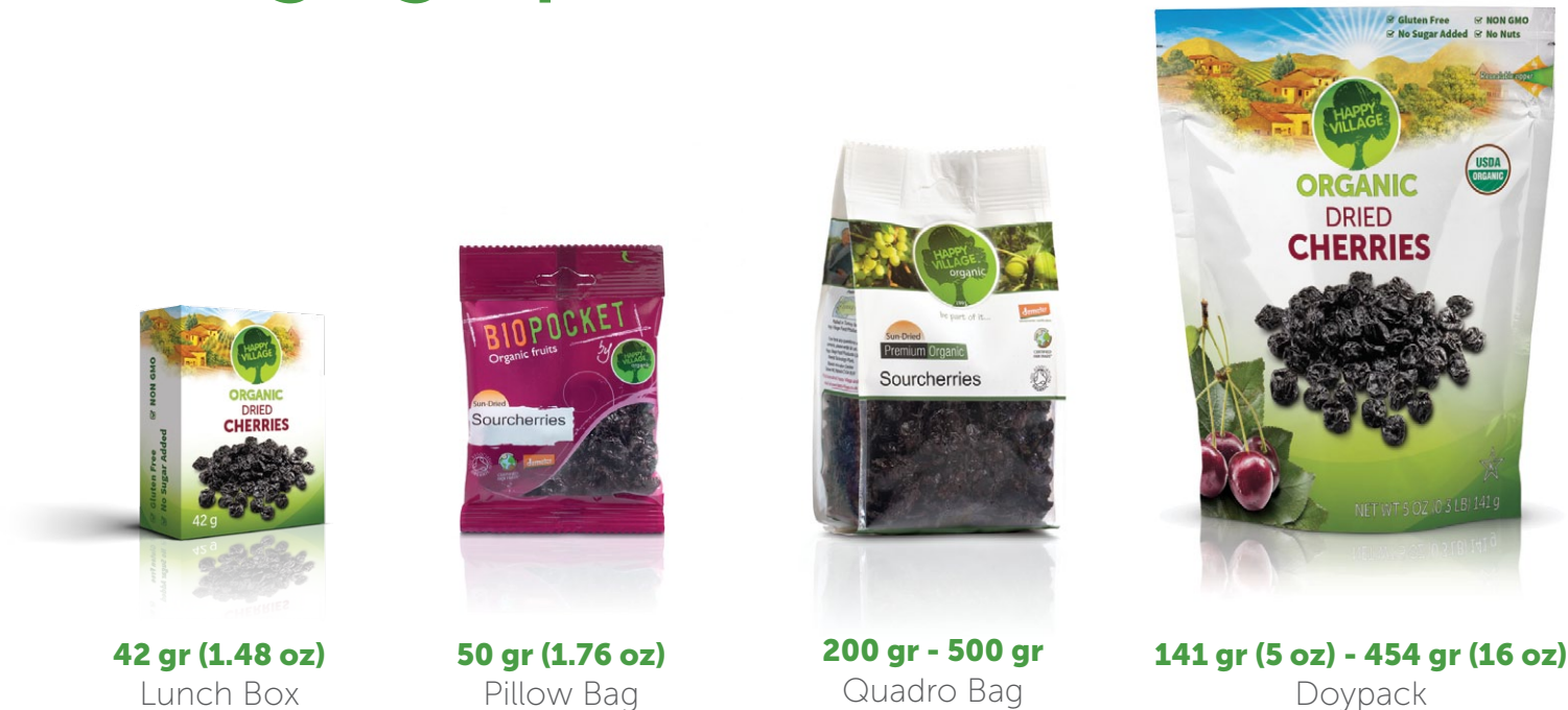
42 gr (1.48 oz) Lunch Box