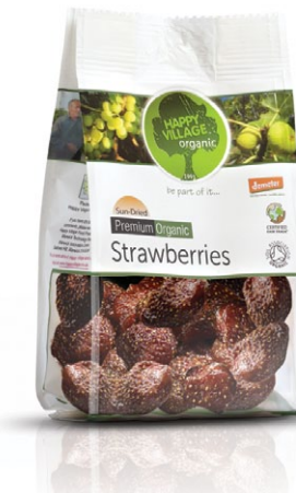
200 gr - 500 gr Quadro Bag