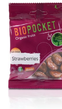
50 gr (1.76 oz) Pillow Bag