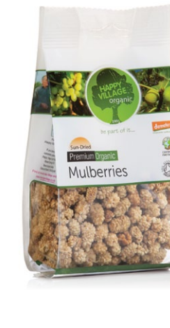
200 gr - 500 gr Quadro Bag