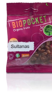
50 gr (1.76 oz) Pillow Bag