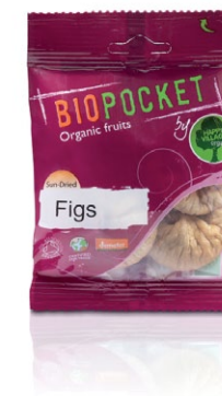
50 gr (1.76 oz) Pillow Bag