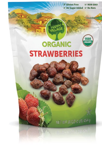
141 gr (5 oz) - 454 gr (16 oz) Doypack