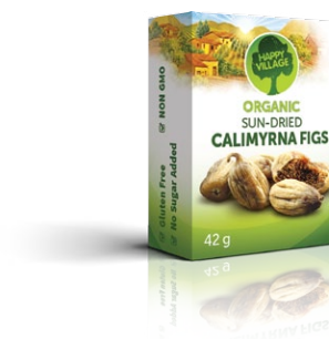
42 gr (1.48 oz) Lunch Box