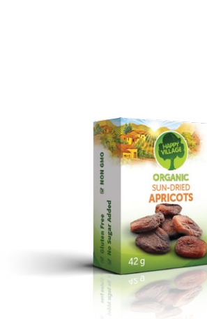
42 gr (1.48 oz) Lunch Box