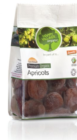
200 gr - 500 gr Quadro Bag