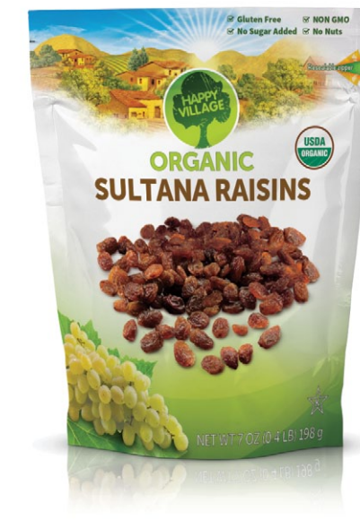
141 gr (5 oz) - 454 gr (16 oz) Doypack