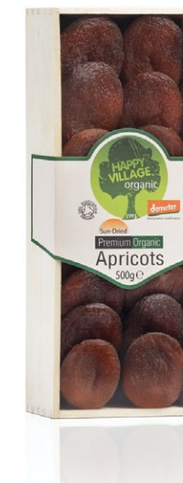
454 gr (16 oz) Specialty / Gift Bag