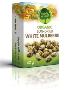
42 gr (1.48 oz) Lunch Box