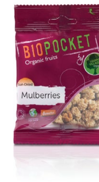
50 gr (1.76 oz) Pillow Bag