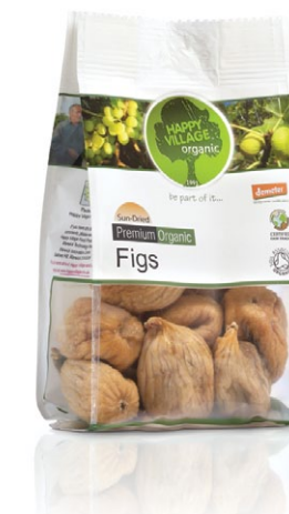
200 gr - 500 gr Quadro Bag