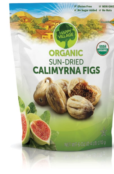
170 gr (6 oz) - 1.13 kg (40 oz) Doypack