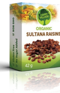
42 gr (1.48 oz) Lunch Box