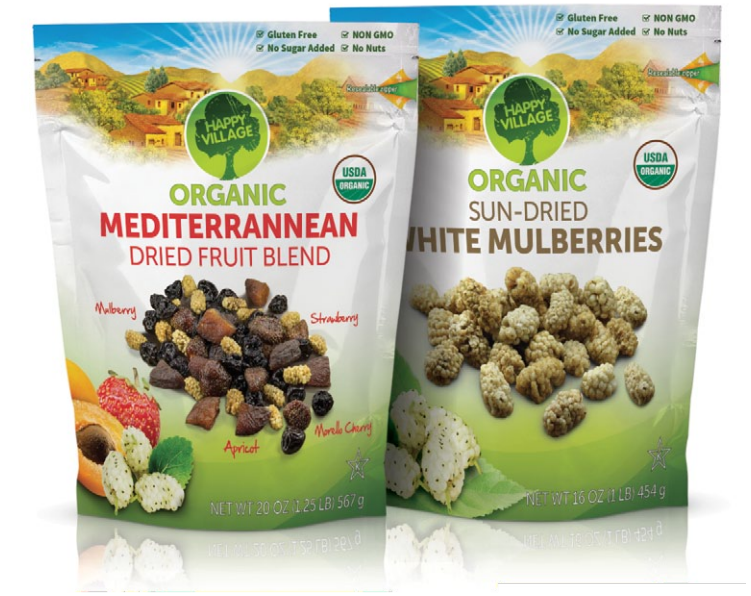
141 gr (5 oz) - 454 gr (16 oz) Doypack